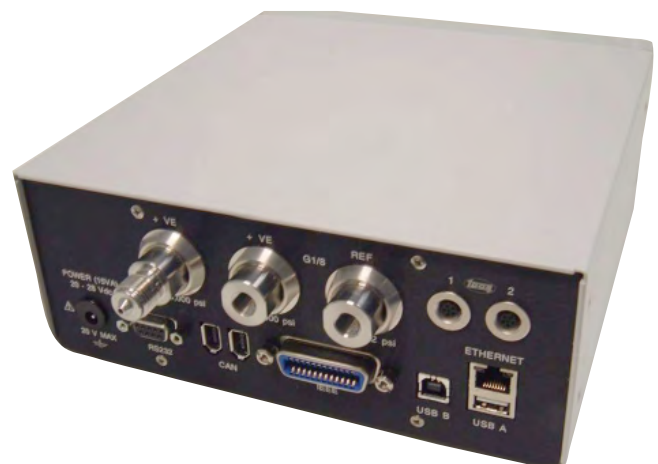
PACE1000 from the rear