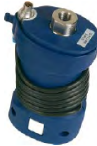
External IDOS universal pressure module

*Provides absolute pressure option in addition to gauge pressure. In absolute mode adds barometric pressure to gauge pressure range. For absolute mode ranges below 1 bar please consult your sales representative.