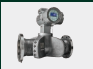
Sentinel LCT8 Eight-path accuracy under changing conditions