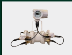
Sentinel LCT Buffered transducers for extended temperature range