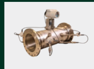
Sentinel LNG Buffered transducers for cryogenic measurement