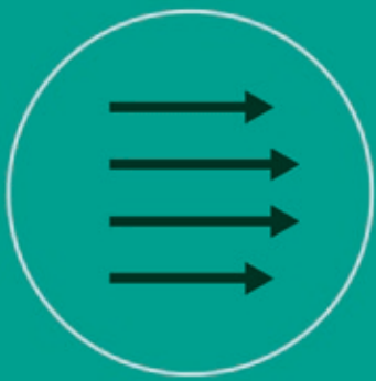
Traditional 4-path design

Eight paths also mean faster response for monitoring and analyzing processes. This minimizes downtime for yield management and asset protection, while providing actionable data when issues occur.