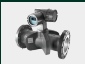
Sentinel LCT4 Optimized, cost-effective four-path design